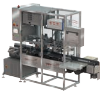
Combination EOL with HV testing